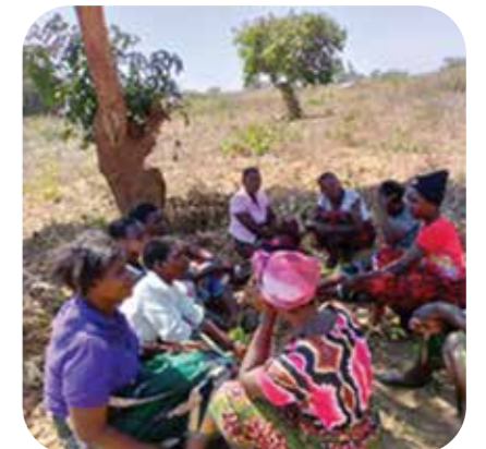
SFHC uses innovative training techniques to disseminate knowledge.