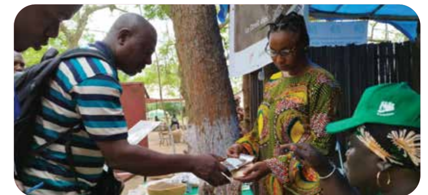
Working with communities to improve soils, nutrition and livelihoods.