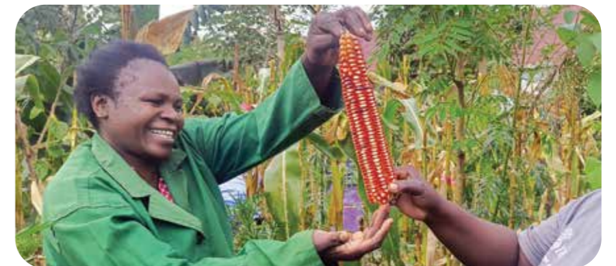
Field trials and demonstrations provide practical, local evidence of agroecological practice.