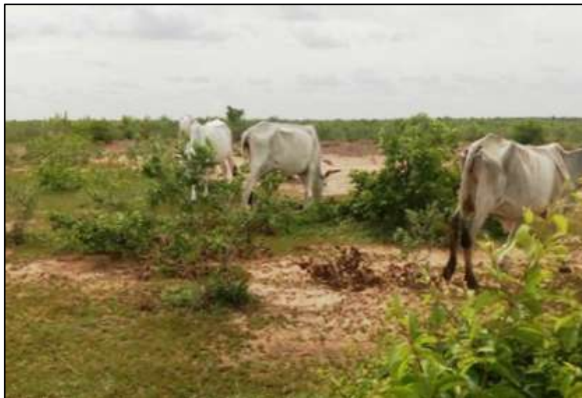
Cows during transhumance in Nigeria

The movement of animal during this period is from south to north as southern part and the middle belt zones of Nigeria are with heavy rain. The flocks of our sheep herders are now returning to the Sahel zone where there is low rain. Crops farmers are now concentrating more seriously on the upland area for cultivation of arable crops.