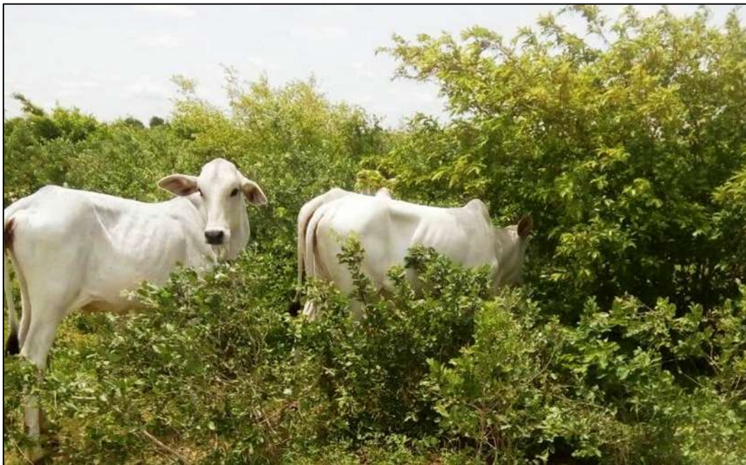
Cows during transhumance in Nigeria